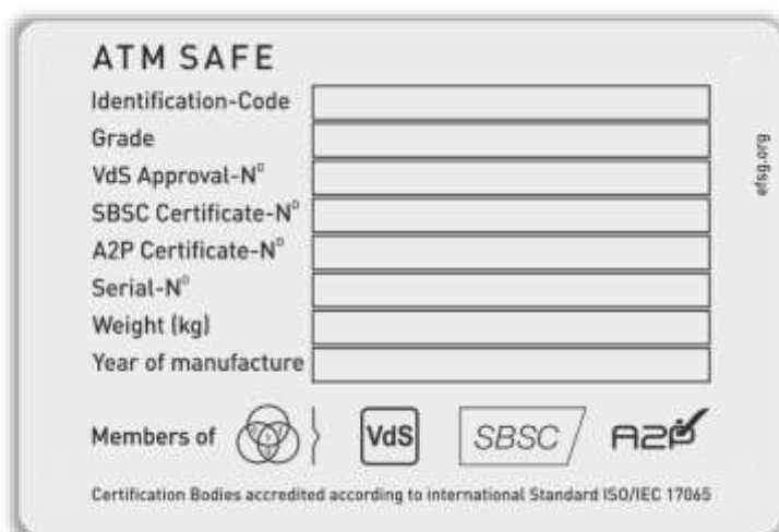
Figure 1: Common certification plate for an ATM safe

Note. The common certification plate is only available in English language.